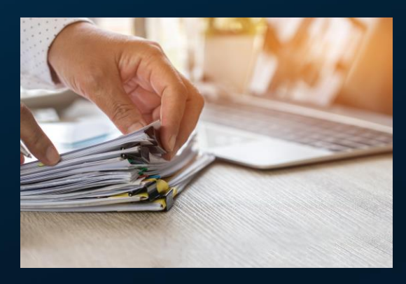
Keep track of Poortwachter files.