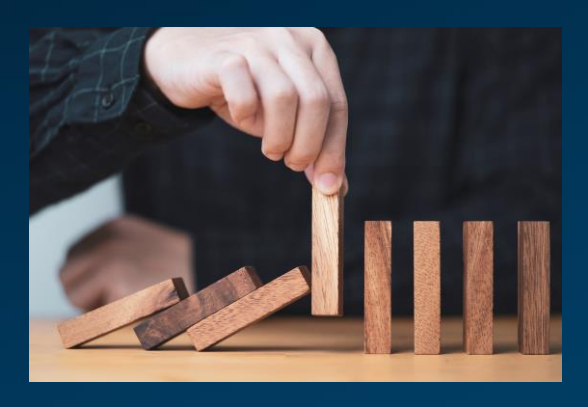
Proactively send alerts when a Poortwachter activity is (almost) expired or when a sick leave is entered or changed.