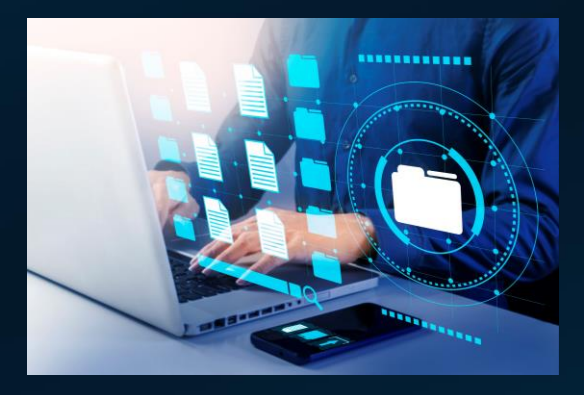
Get access to historical Poortwachter files.